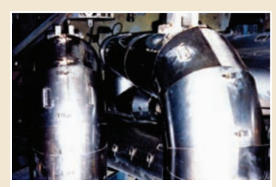
NUKON<sup>®</sup> pipe insulation installed inside the drywall of a BWR