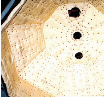
NUKON<sup>®</sup> blankets on the underside of a BWR RPV top bend "dog house."

PCI has been audited and accepted under the NUPIC Team Audit system on several occasions. In addition, PCI welcomes Quality Assurance audits or surveys by individual nuclear utilities or general contractors requiring nuclear safety-related work.