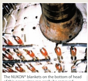
The NUKON® blankets on the bottom of head of this pressurizer can easily be removed for future inspection and reinstalled quickly without tools.

To determine its installed performance, PCI has performed a number of tests and engineering analyses on the NUKON® system. These have demonstrated that the NUKON® system will not