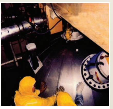
This shows the installation of NUKON<sup>®</sup> with MSG on a pressurized top bead.