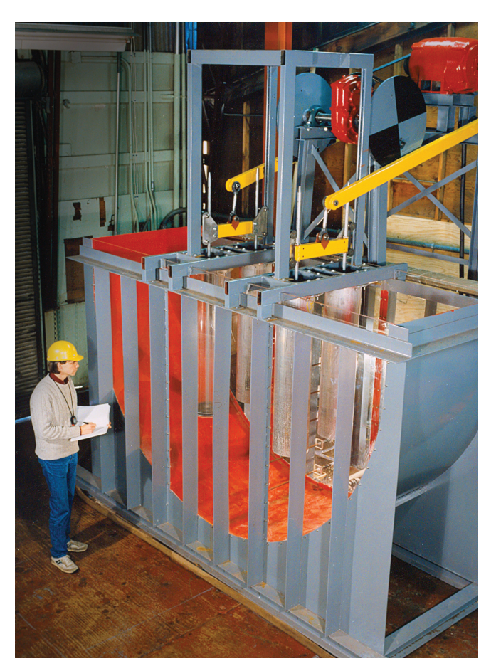
BWR testing facility at Alden Lab